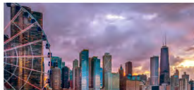
ASCO May 31 - June 4, 2024 | Chicago, IL Booth #11112