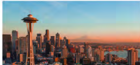
ARVO May 5-9, 2024 | Seattle, WA Booth #1439

We love meeting Sponsors, partners, and industry professionals! Network with us at one of our upcoming conferences or trade shows. You can set up an appointment with one of our team members by going to the Events page on our website and clicking on the event of interest!