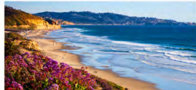
ATS May 17-22, 2024 | San Diego, CA Booth #3136