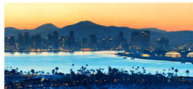
DIA June 16-20, 2024 | San Diego, CA Booth #2209

Feel free to forward our newsletter to any colleagues who might be interested. Thanks for reading! Subscribe to stay up-to-date.